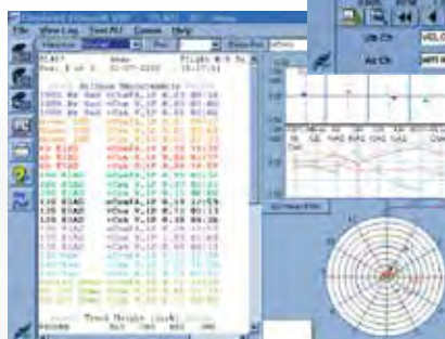
Spectral Plot integrates & differentiates into any units...mils, IPS, g's, etc.